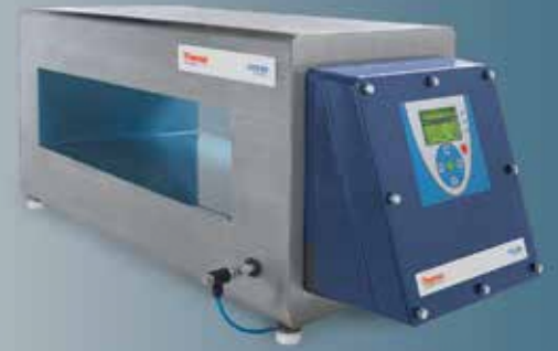
Thermo Scientific APEX 500 Metal Detector